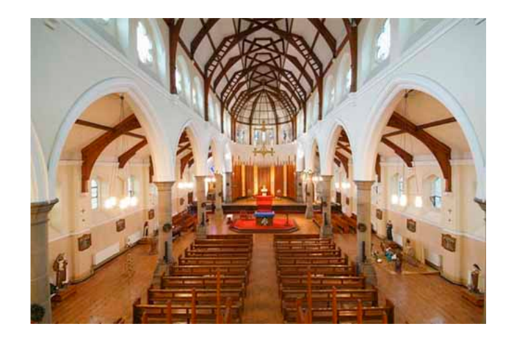
Fig.5 A typical EW Pugin 'vessel' church with wide nave arcades and roof timbers that resemble the ribs of the hull of a wooden vessel ( Our Lady's, Eldon St, Liverpool )

Externally, this results (in the absence of transepts) in a kind of (inverted) 'vessel' church, within which the roof timbers are reminiscent of the ribs of the hull of a wooden vessel; indeed, the term 'nave' comes from the Latin for ship/ boat/ vessel