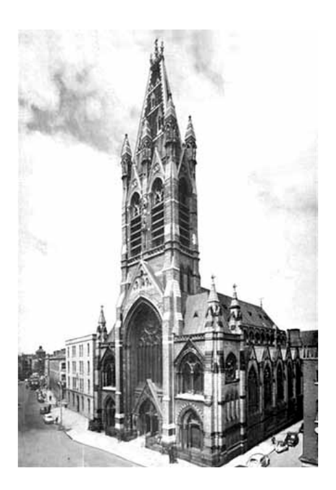
Fig. 6b A Franco-Flemish spire (Ss Augustine & John, Dublin)