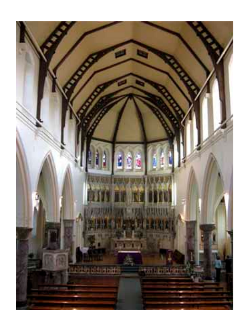
Fig.4a Apsidal sanctuary lit by high level lancets ( Our Lady's, Birkenhead )

• East windows are so large that everything else is hidden in the glare After 1859, the square-ended chancels with their huge East windows, which characterised EW Pugin's earlier churches, were often replaced by chancels ending in an apse and lit by groups of short lancets positioned high up in the wall, just below the start of the roof structure. This reduced the glare (particularly when there were insufficient funds to install stained glass). On the occasions when the design continued to feature a square-ended chancel a Rose window was often incorporated, but again sufficiently high up so as not to be obstructed by any reredos.