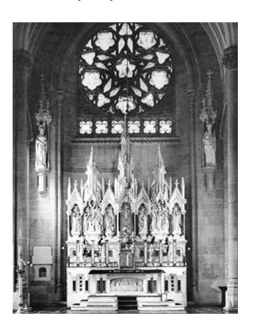
Fig.4b Square-ended sanctuary lit by a Rose window (St Anne's, Rock Ferry)

• His skreens [sic] are so heavy that you might as well have the function in the sacristy, for the seeing of it by the congregation