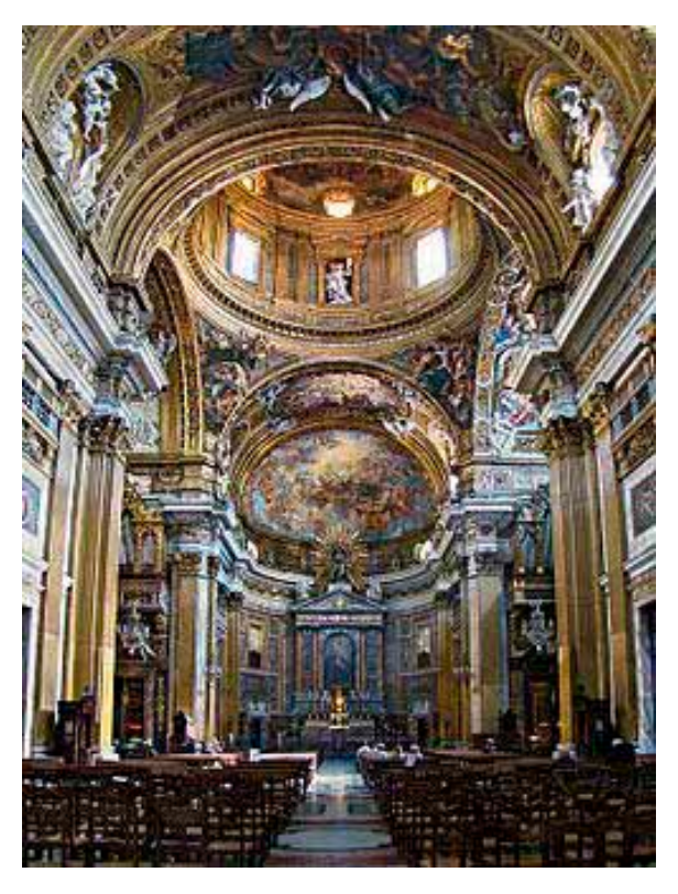
Fig. 2b A Counter-Reformation Baroque church (Church of the Gesù, Rome)

Such an arrangement clearly did not facilitate the fuller "all seeing, all hearing" participation of the Faithful that the Council Fathers at Trent wished to promote with their new (Tridentine) rite. This required an uninterrupted view of the High Altar on which, in order to emphasise its centrality, the Blessed Sacrament was to be reserved in a